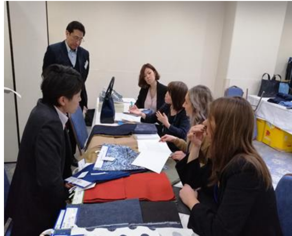
Business matching with local companies