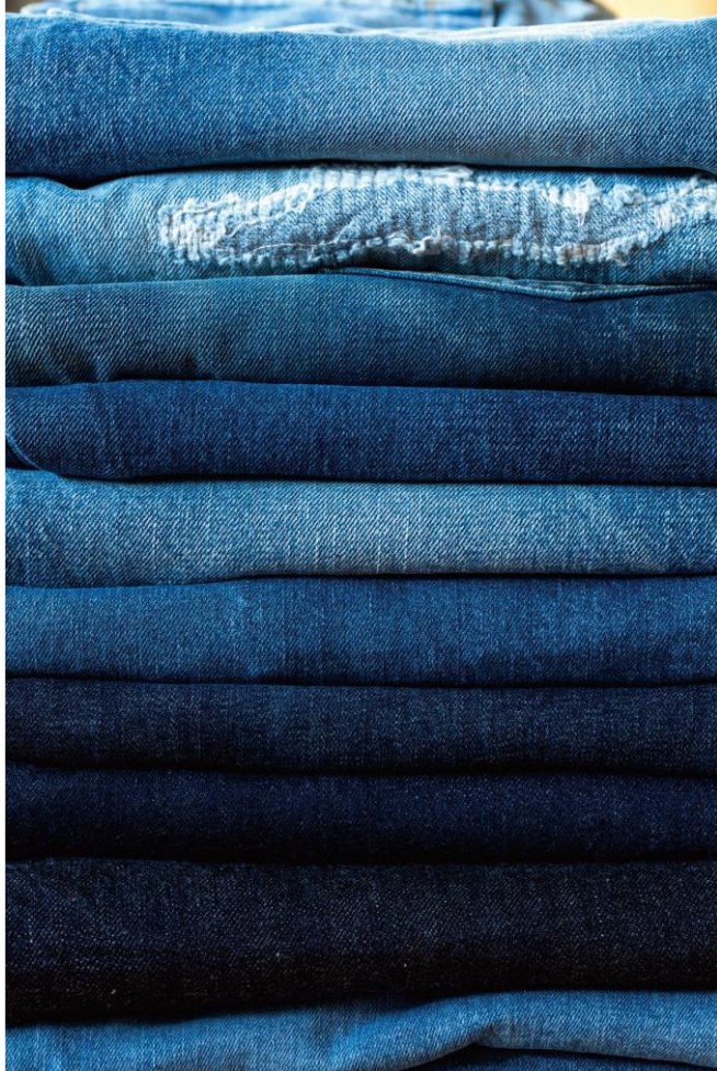
PR by JAPAN DENIM Story Book